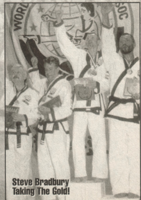
Steve Bradbury Taking The Gold!