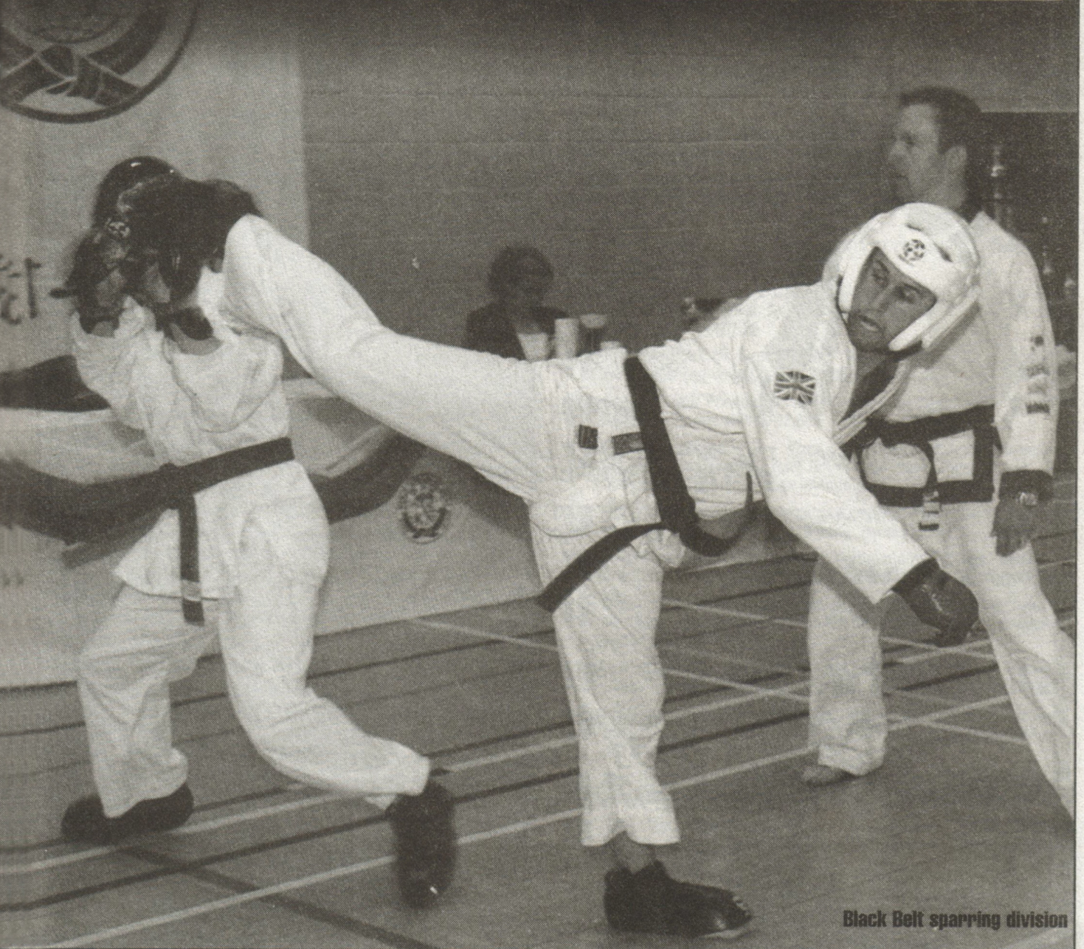
Black Belt sparring division