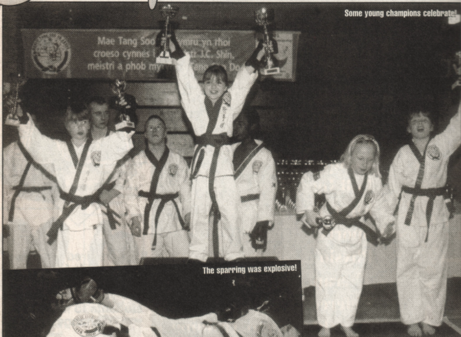
Some young champions celebrate!