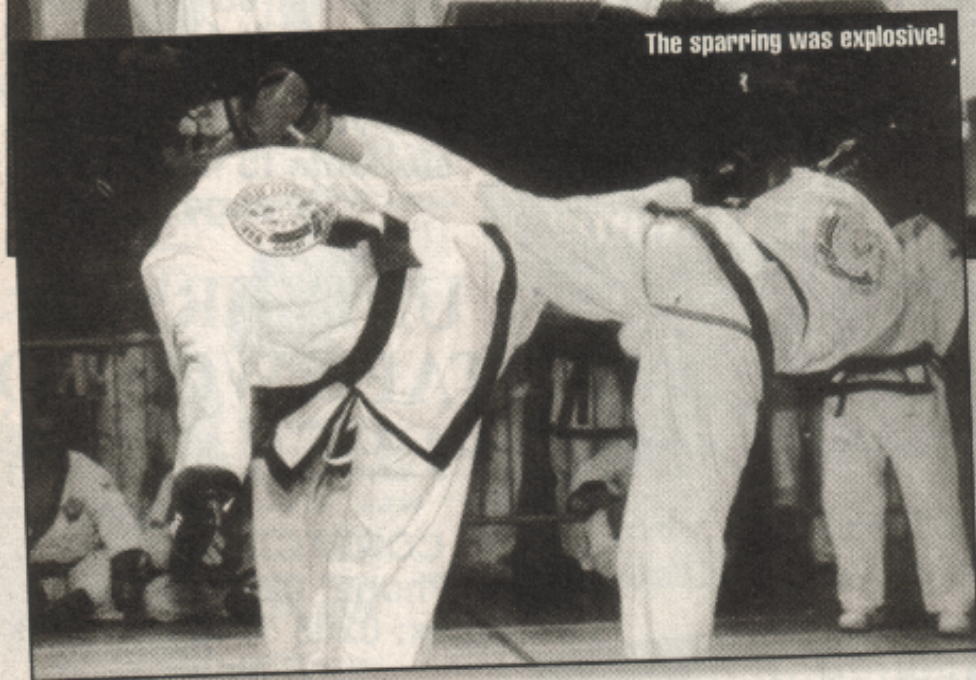
The sparring was explosive!

G reat Britain Tang Soo Do, once again, was chosen to host the 2001 European Championships. This prestigious event is held every two years and no other European country has ever been chosen to host this event over consecutive periods.